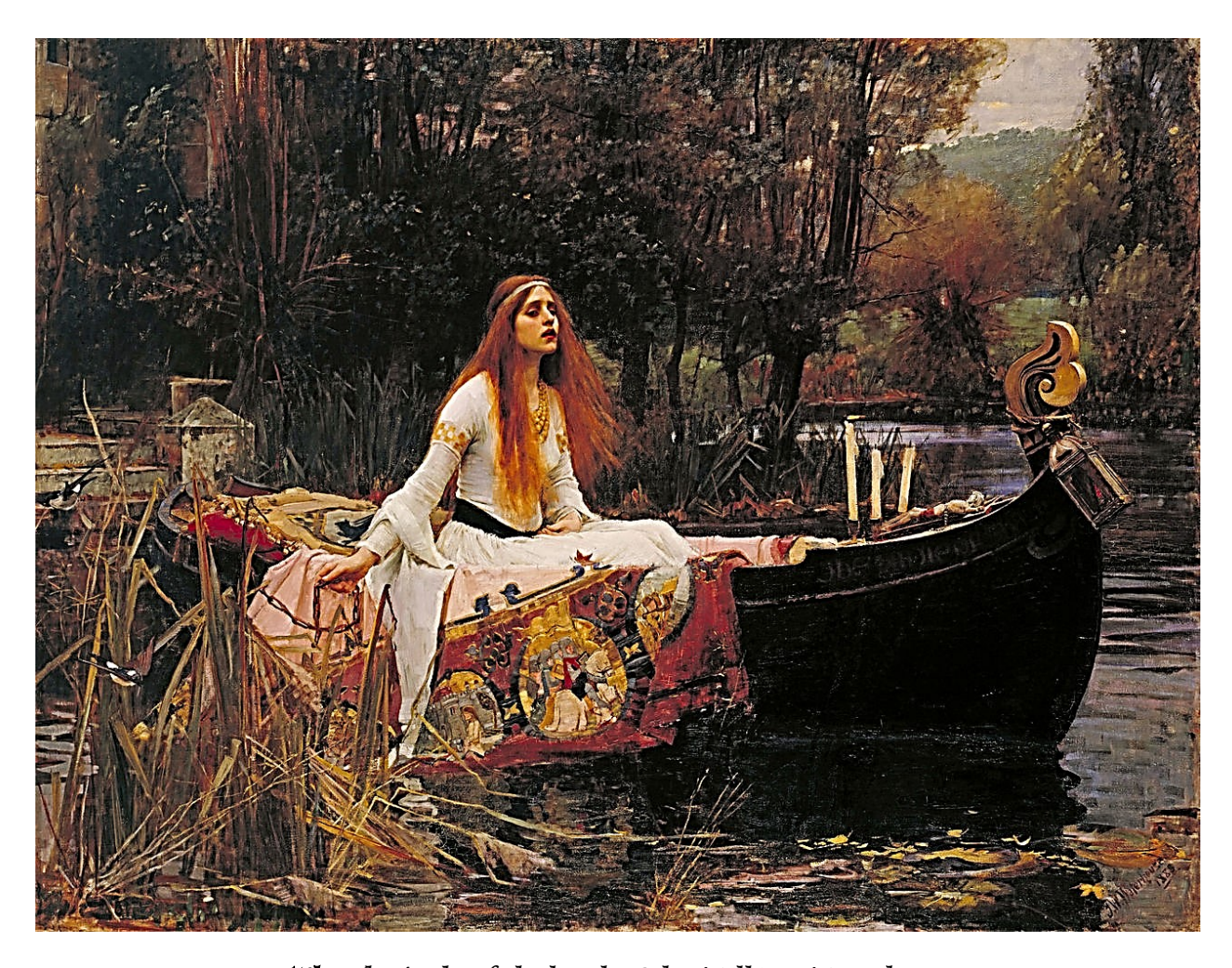
Títle: The Lady of Shalott by John William Waterhouse Completion Date: 1888 Technique: oil Material: canvas Dimensions: 153 x 200 cm Location: Tate Britain