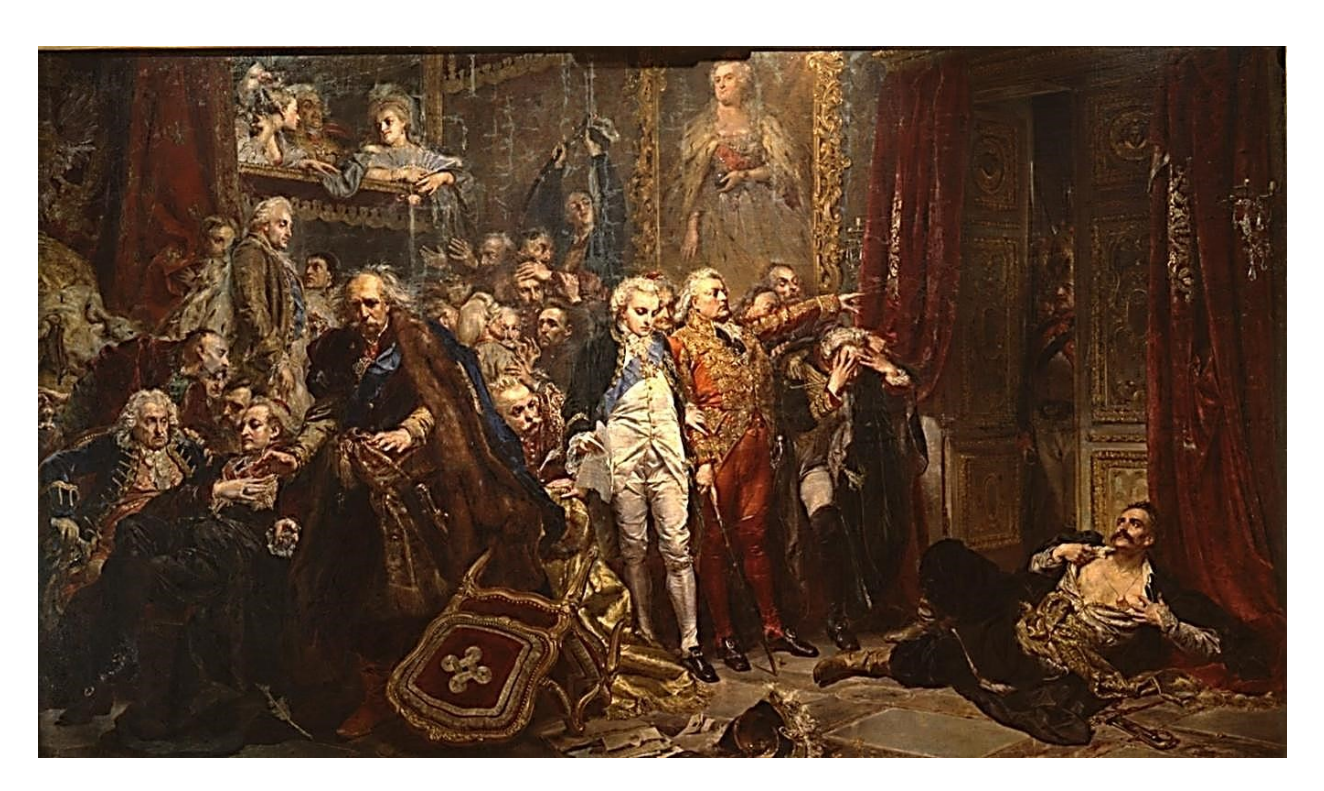
Títle: The Fall of Poland by Jan Matejko Completion Date: 1866 Technique: oil Material: canvas Dimensions: 282 × 487 cm