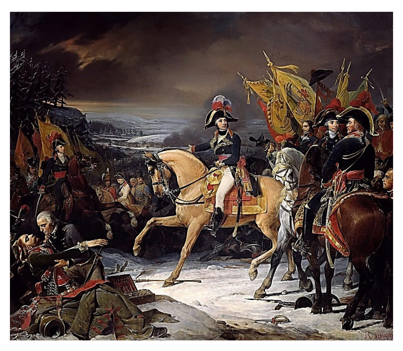
Títle: Battle of Hohenlinden by Henri Frederic Schopin Completion Date: 1836 Technique: oil Material: canvas Dimensions: 465 x 543 cm Location: Palace of Versailles